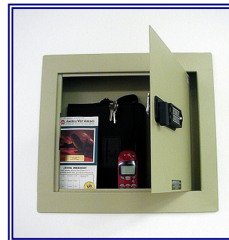
MODEL WS-300-4-ECAM SHOWN ABOVE SIDE HINGE ONLY, NO SHELF INCLUDED